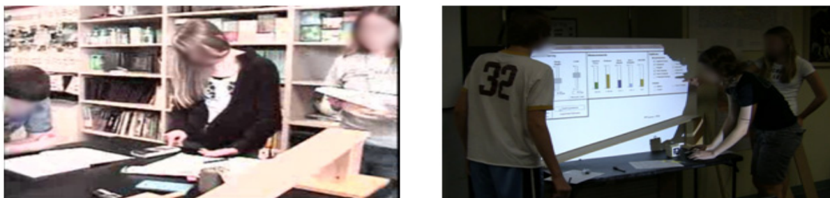
Figure 2. Students Recording Data after Running a Trial in the Physical (Left) and Mixed Reality (Right) Environments.

anchor to publicly make meaning of the data. In the example on the right side of figure 2, one student is pointing toward a graphical representation of work and stating to her group members, “I think work output never changes, because the last time it was [the same].” While in the physical experiment there was only one instance of joint attention around shared referential anchors after a trial (via a student notebook), 8 of the instances in the virtual environment and 5 of the instances in the mixed reality environment occurred between trials (see Table 1).